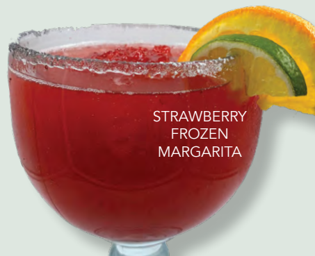
STRAWBERRY FROZEN MARGARITA

Gold tequila, triple sec and our fiesta mix perfected by machine. Lime, Strawberry, Mango, Peach, Raspberry